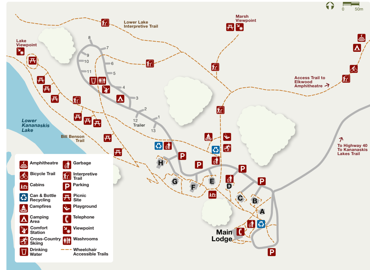
William Watson Lodge Site Map

More information is available at albertaparks.ca/wwl .