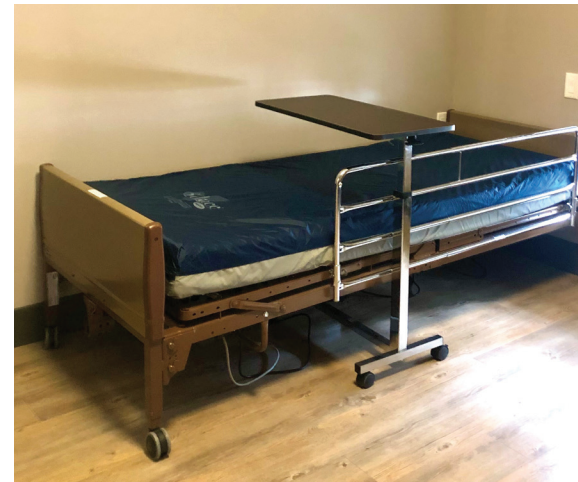
Each 2 or 3 bedroom unit has 1 hospital bed

The trailer is not accessible. It sleeps four people in one double bed and a double bunk bed. (ladder access to top bunk). No animals are allowed in the trailer.